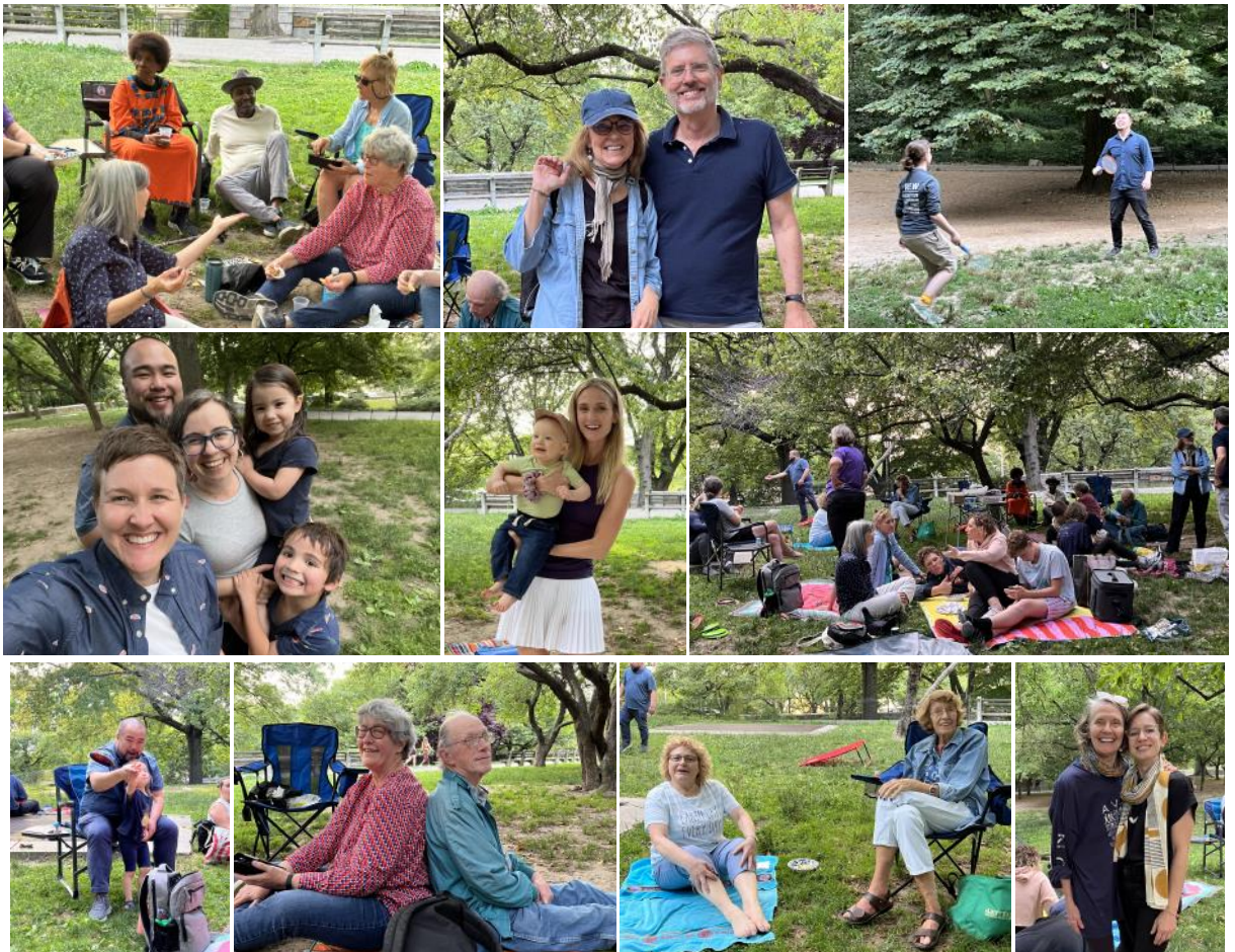
On Tuesday, we came, we saw, we picnicked (Riverside Park)!