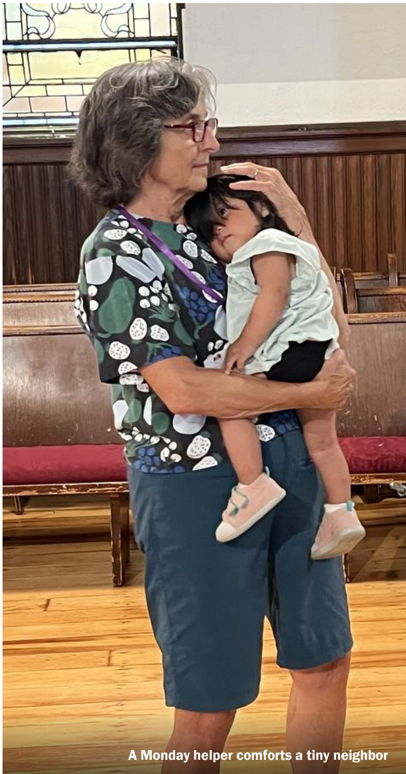
A Monday helper comforts a tiny neighbor