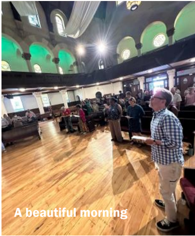
A beautiful morning