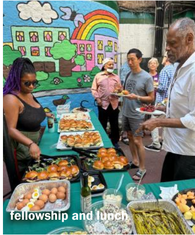
fellowship and lunch