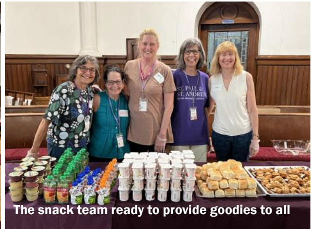
The snack team ready to provide goodies to all