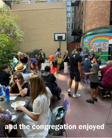
and the congregation enjoyed