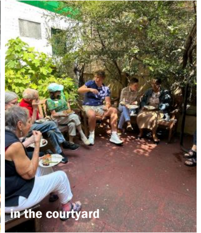
in the courtyard