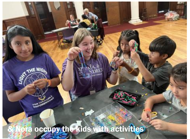
& Nora occupy the kids with activities