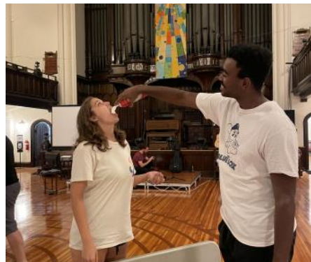
Midnight Pancakes: Our LaMP Campus Ministry fed 239 hungry Columbia students, and had fun!