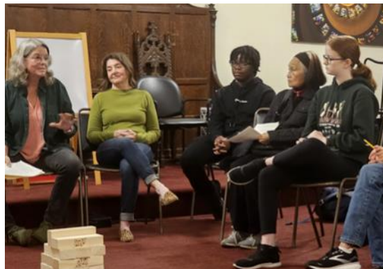
At last week's Homework Help orientation meeting.