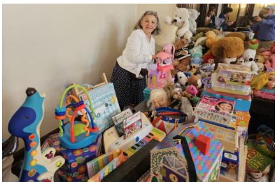
Setting up for Migrant Monday