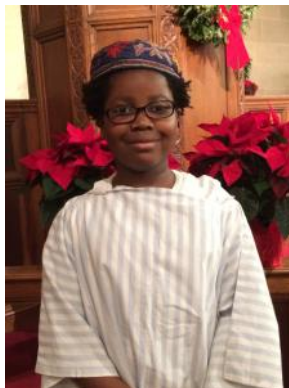
A shepherd in our pageant.