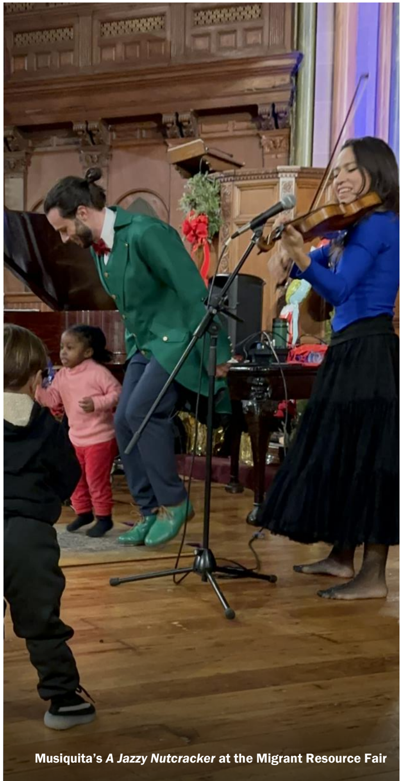
Musiquita's A Jazzy Nutcracker at the Migrant Resource Fair