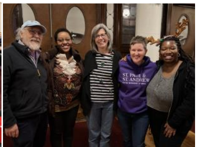
Homework Help finished 2023 with a party, and thanks again to UJA/JCC, presents for the kids to bring home gifts!