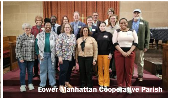
Eower Manhattan Cooperative Parish