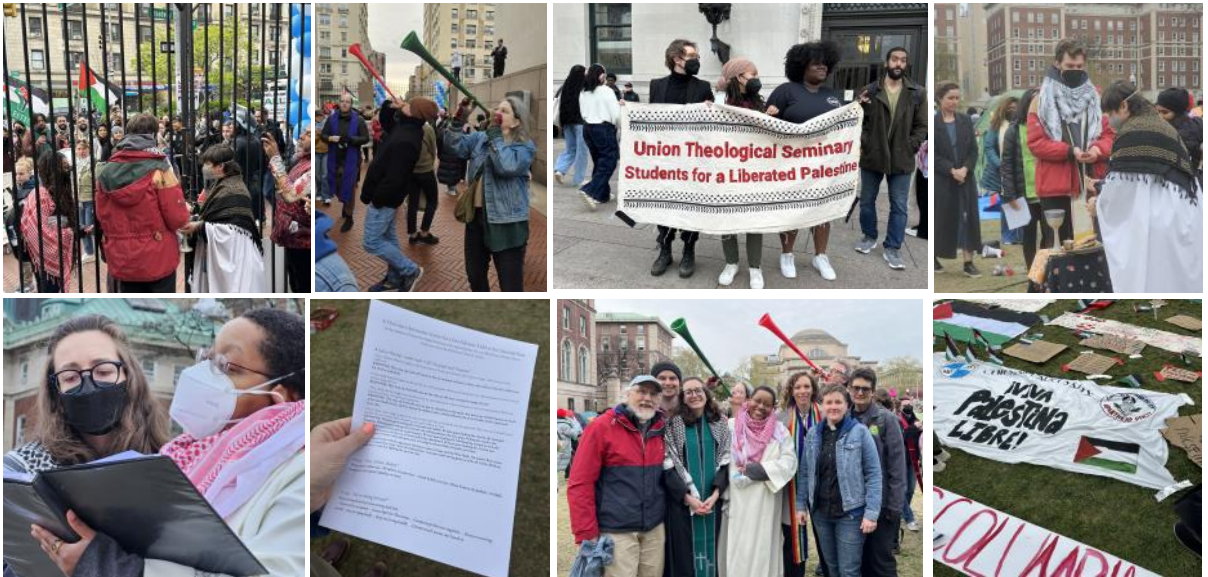
Union Theological seminary students organized and led a service of worship and communion inside the encampment on Monday at Columbia University.